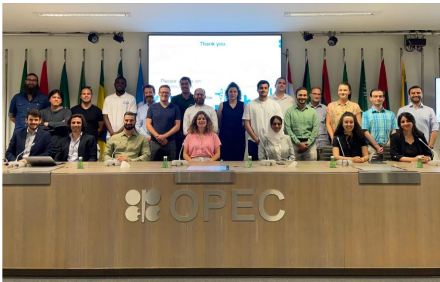
Group photo at OPEC’s Headquarters in Vienna.

We would like to give huge thanks to the organizers from the SPE Vienna Basin Section and to everyone else involved in making the first Beyond The Borders initiative of 2022, and the first in-person event in two years, a success!