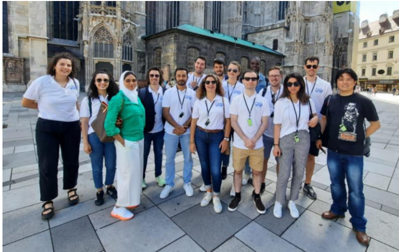
Group photo on Saturday during the city tour of Vienna.