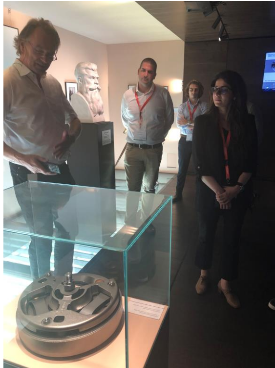
Learning about Hoerbiger's history, starting from its founder, in the museum section of the building.