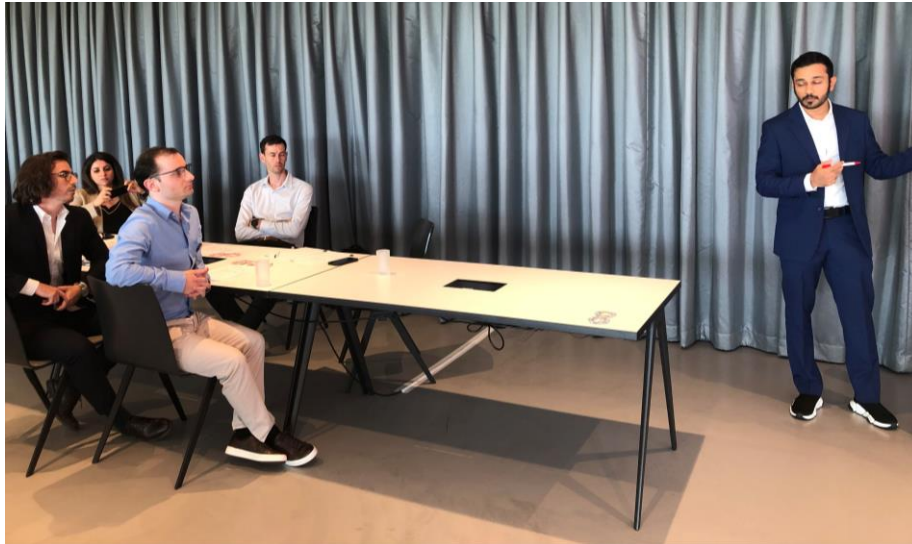
Each group presenting their thoughts in their respective world scenarios (group exercise) during the workshop.