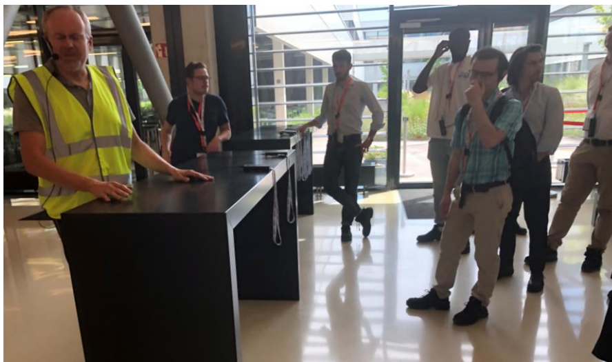
A short talk by the tour guide just before entering Hoerbiger's manufacturing zone of the building.