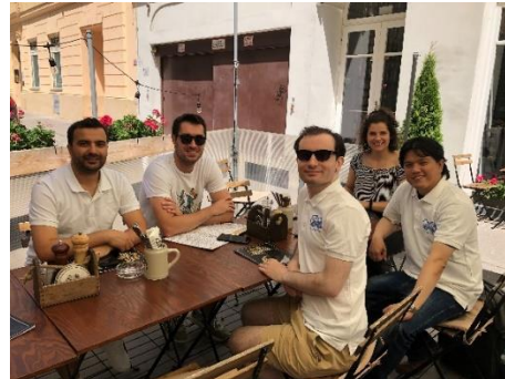
Various photos taken during the city tour on Saturday, the last day of the Beyond The Borders event.